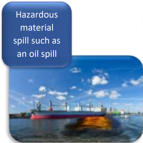
Hazardous material spill such as an oil spill